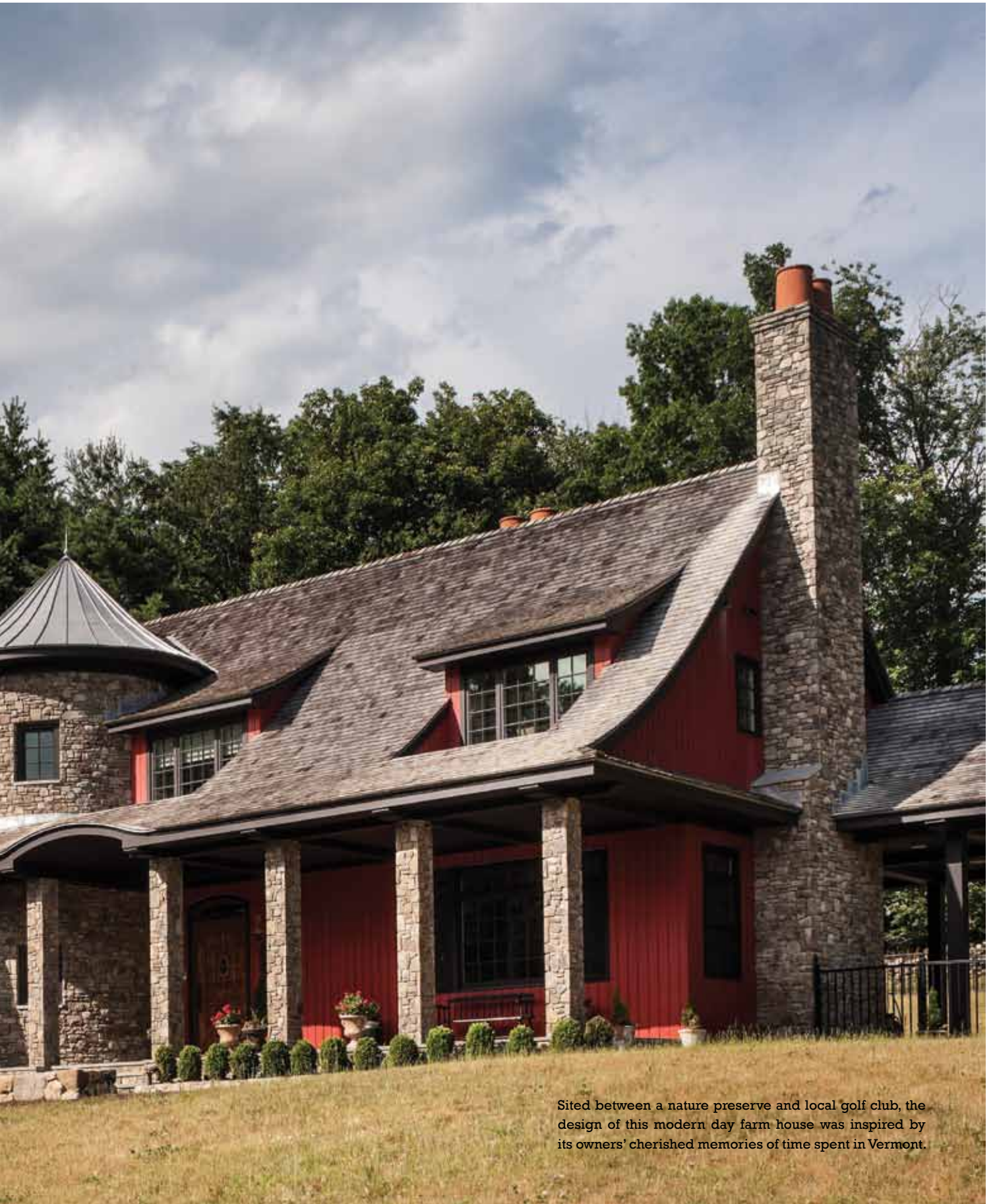
Sited between a nature preserve and local golf club, the design of this modern day farm house was inspired by its owners' cherished memories of time spent in Vermont.