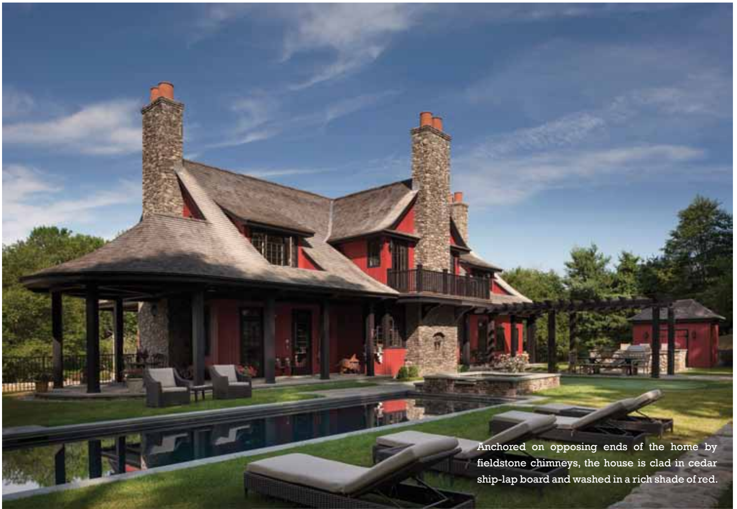
Anchored on opposing ends of the home by fieldstone chimneys, the house is clad in cedar ship-lap board and washed in a rich shade of red.