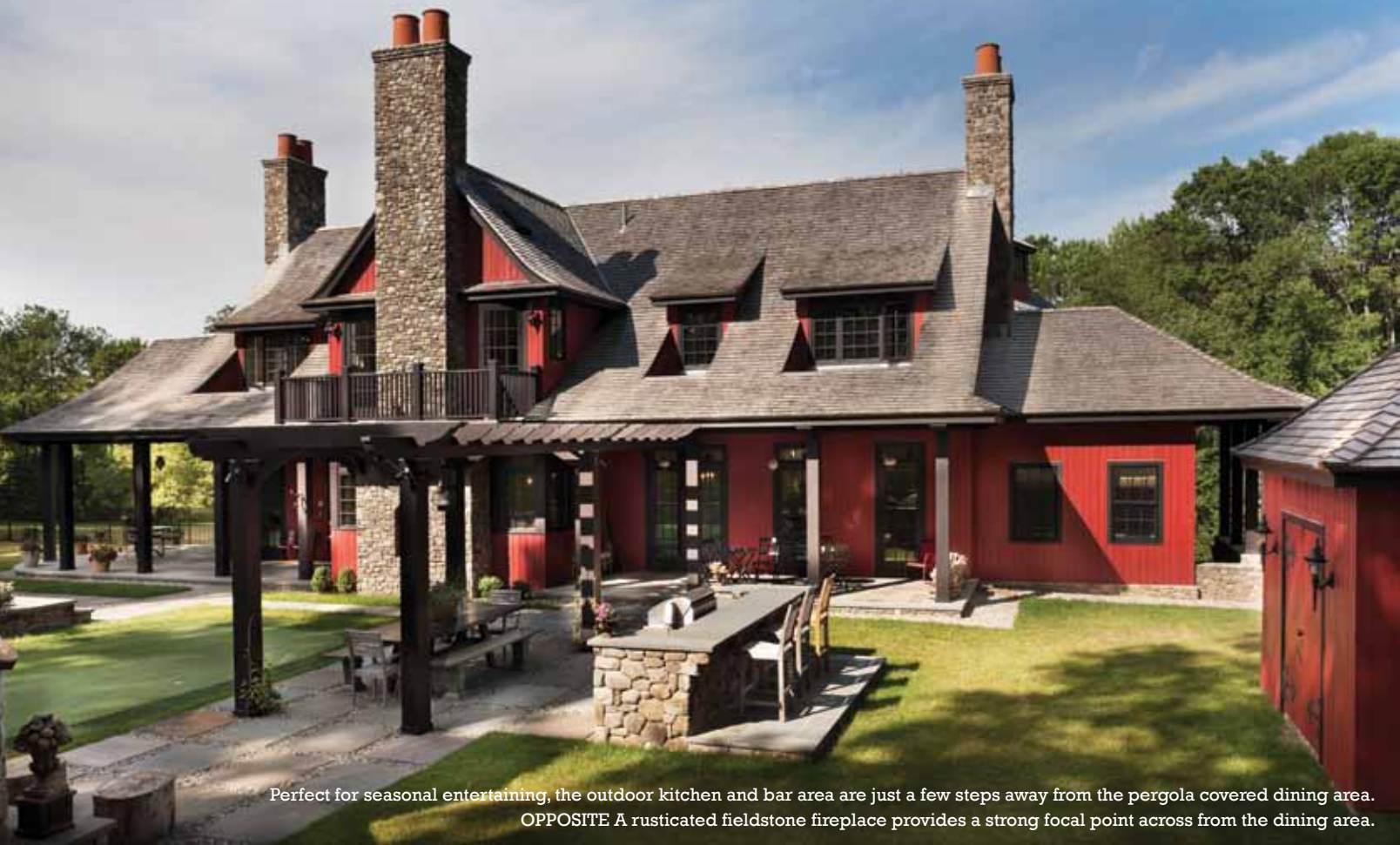
Perfect for seasonal entertaining, the outdoor kitchen and bar area are just a few steps away from the pergola covered dining area. OPPOSITE A rusticated fieldstone fireplace provides a strong focal point across from the dining area.